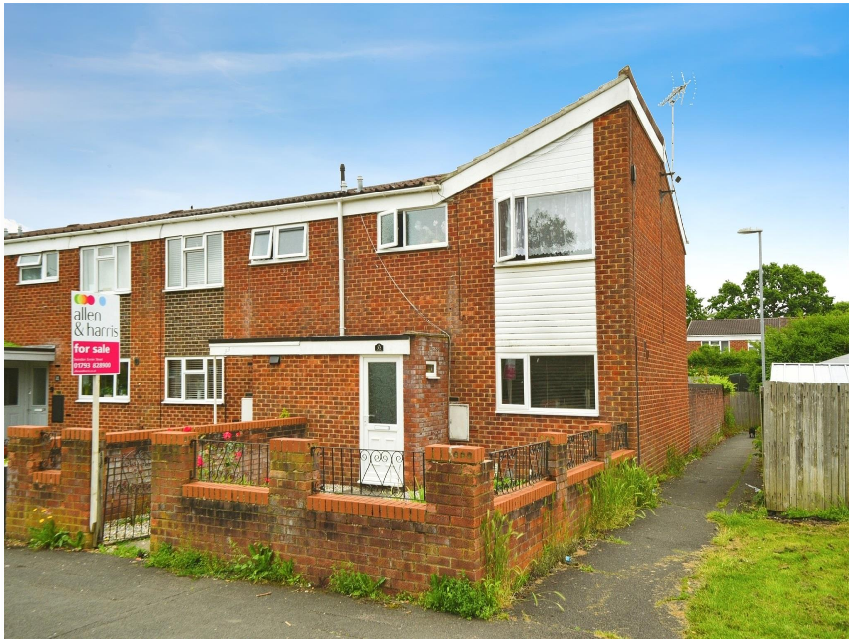
Bowleymead, Swindon SN3 3TD