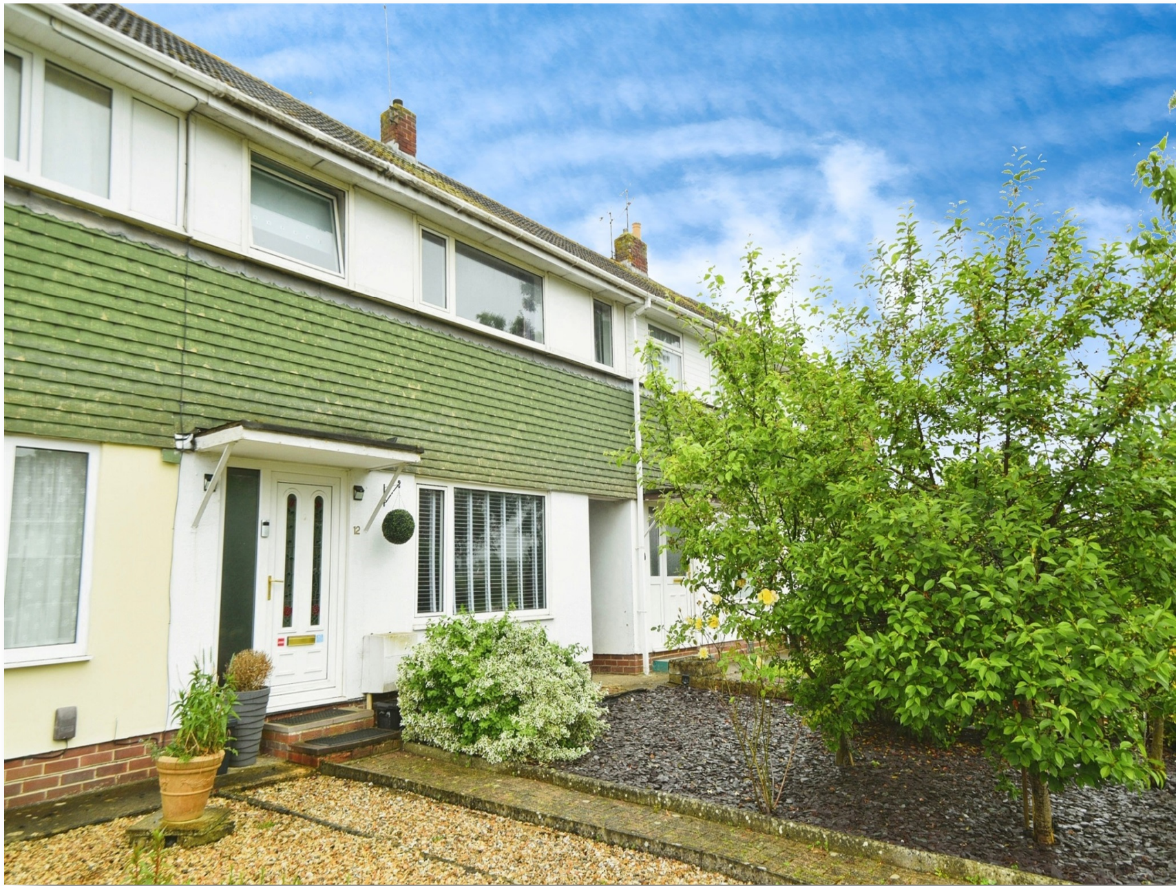
Egerton Close, Swindon SN3 3ND