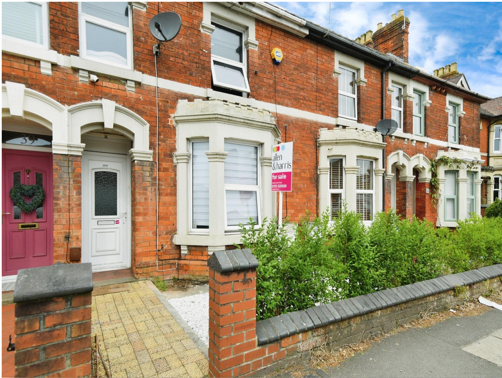
Highworth Road, Swindon SN3 4QL