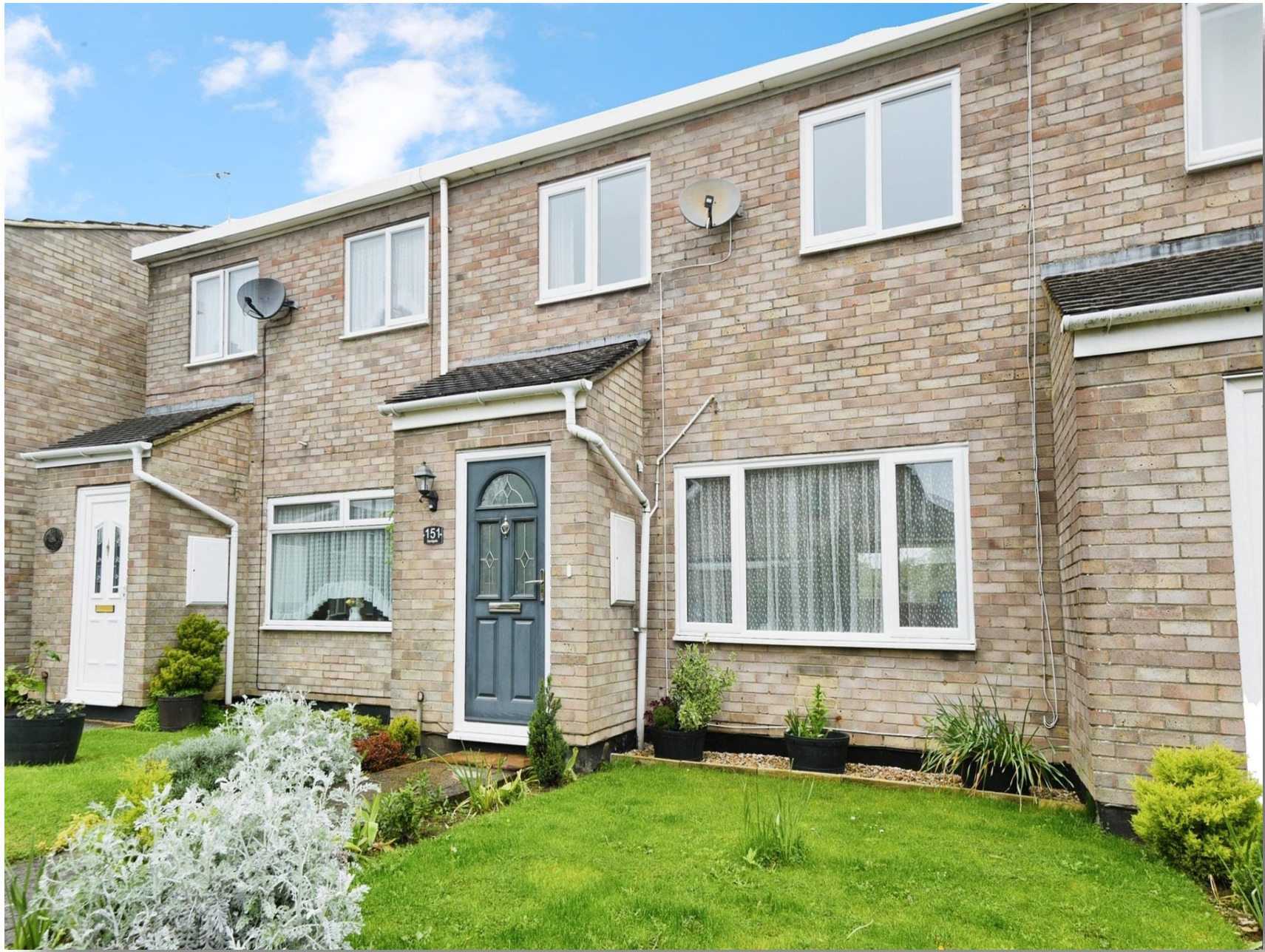
Sandgate, Swindon SN3 4HJ