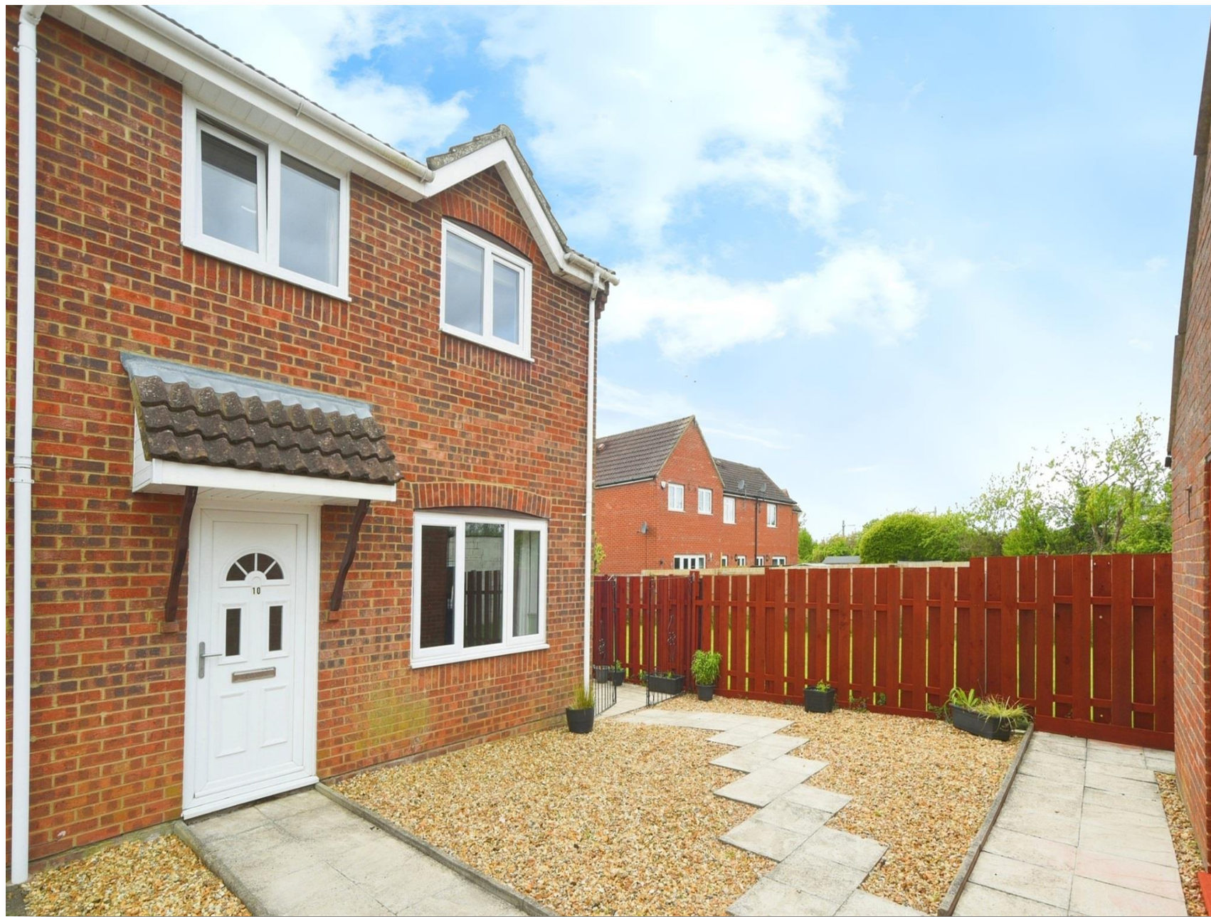
Burgess Close, Stratton, Swindon SN3 4FJ