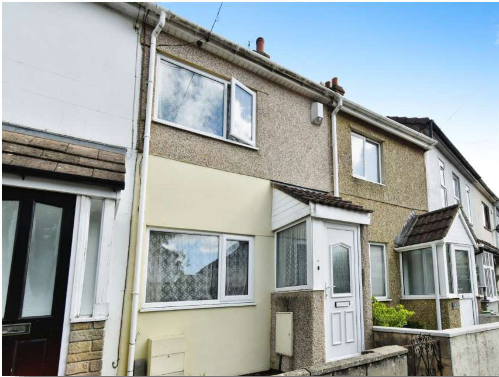
Dores Road, Swindon SN2 7QU