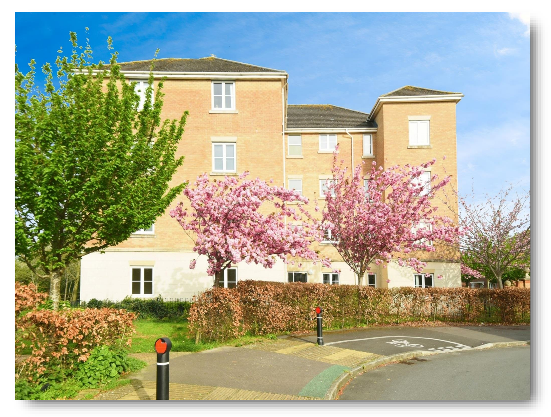
Millwater House, Melusine Road, Swindon SN3 4EP