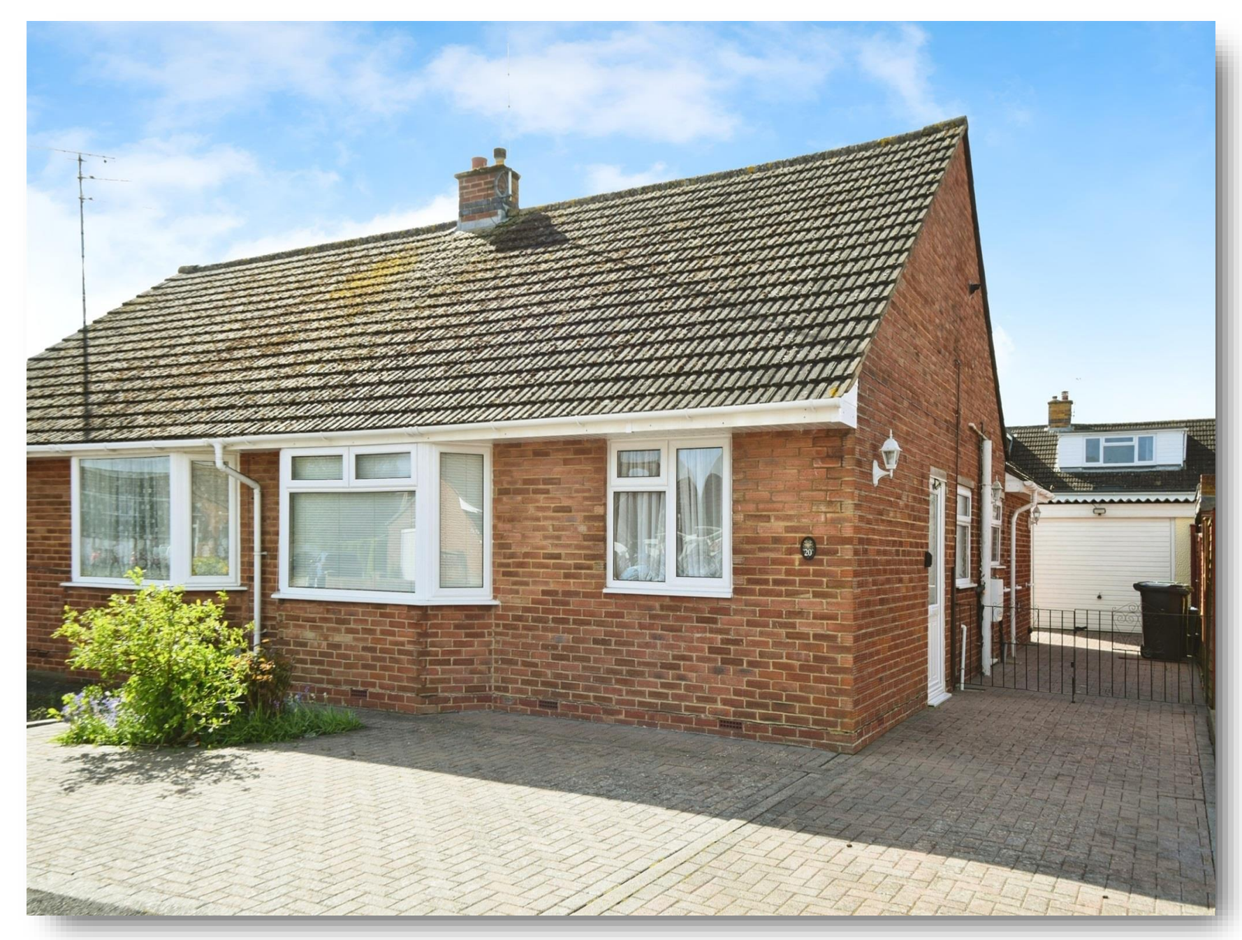
Abington Way, Swindon SN2 7SZ