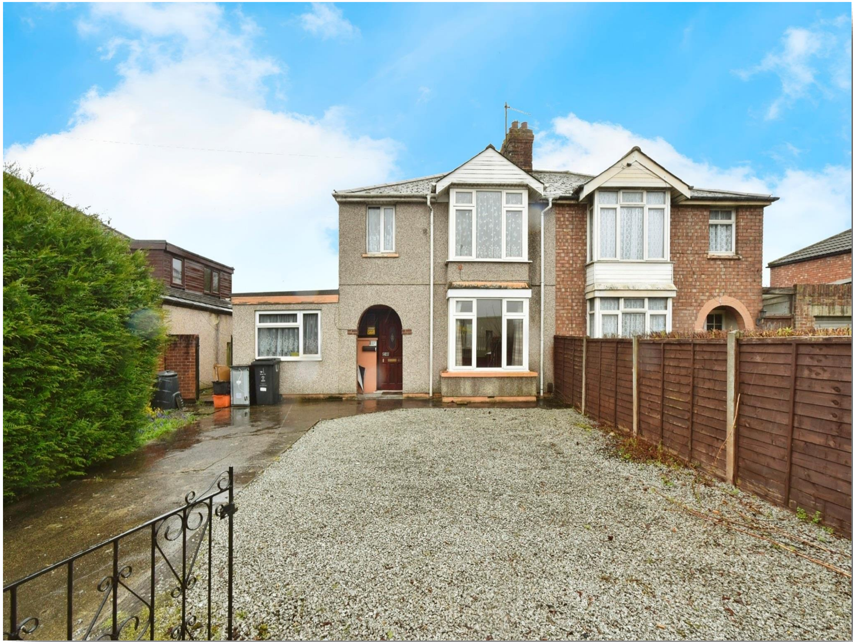
Bridge End Road, Swindon SN3 4PD