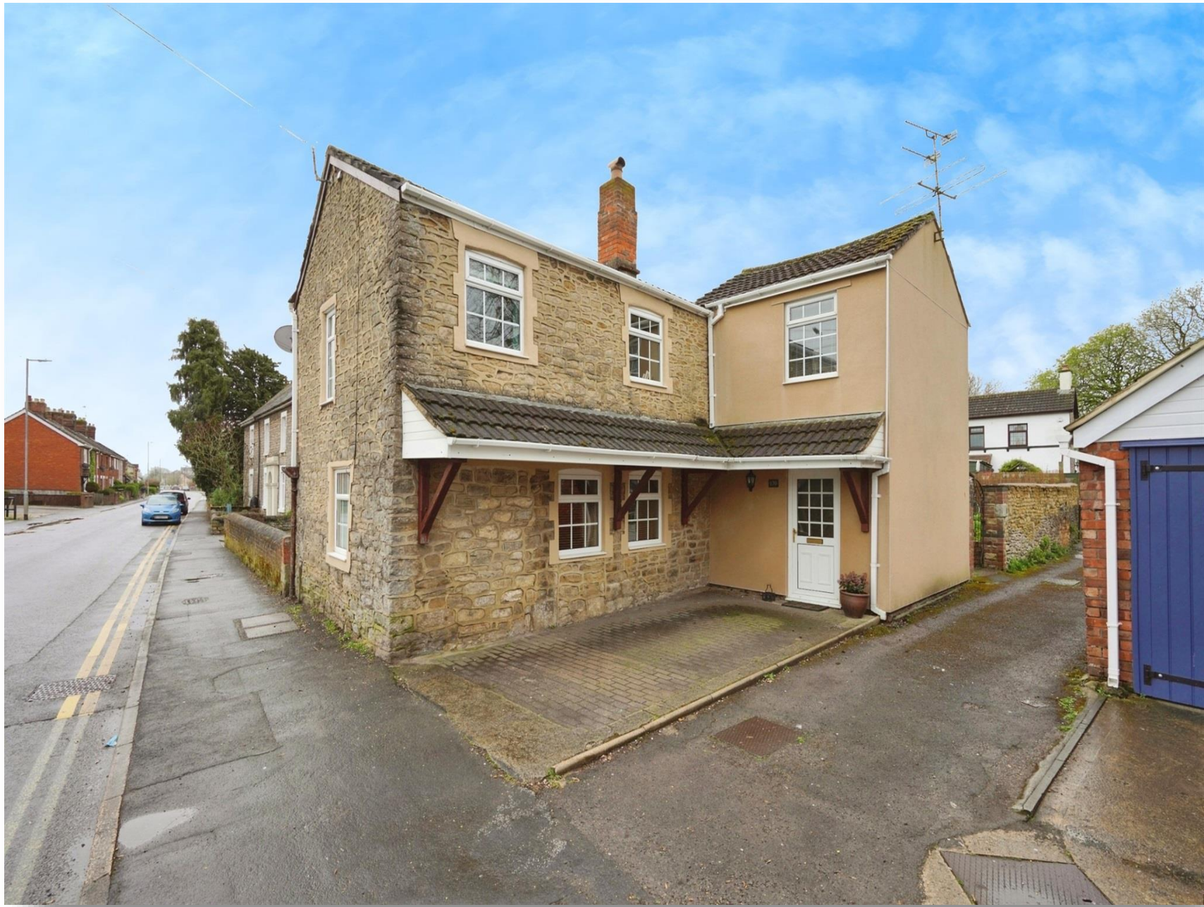
Ermin Street, Swindon SN3 4NE