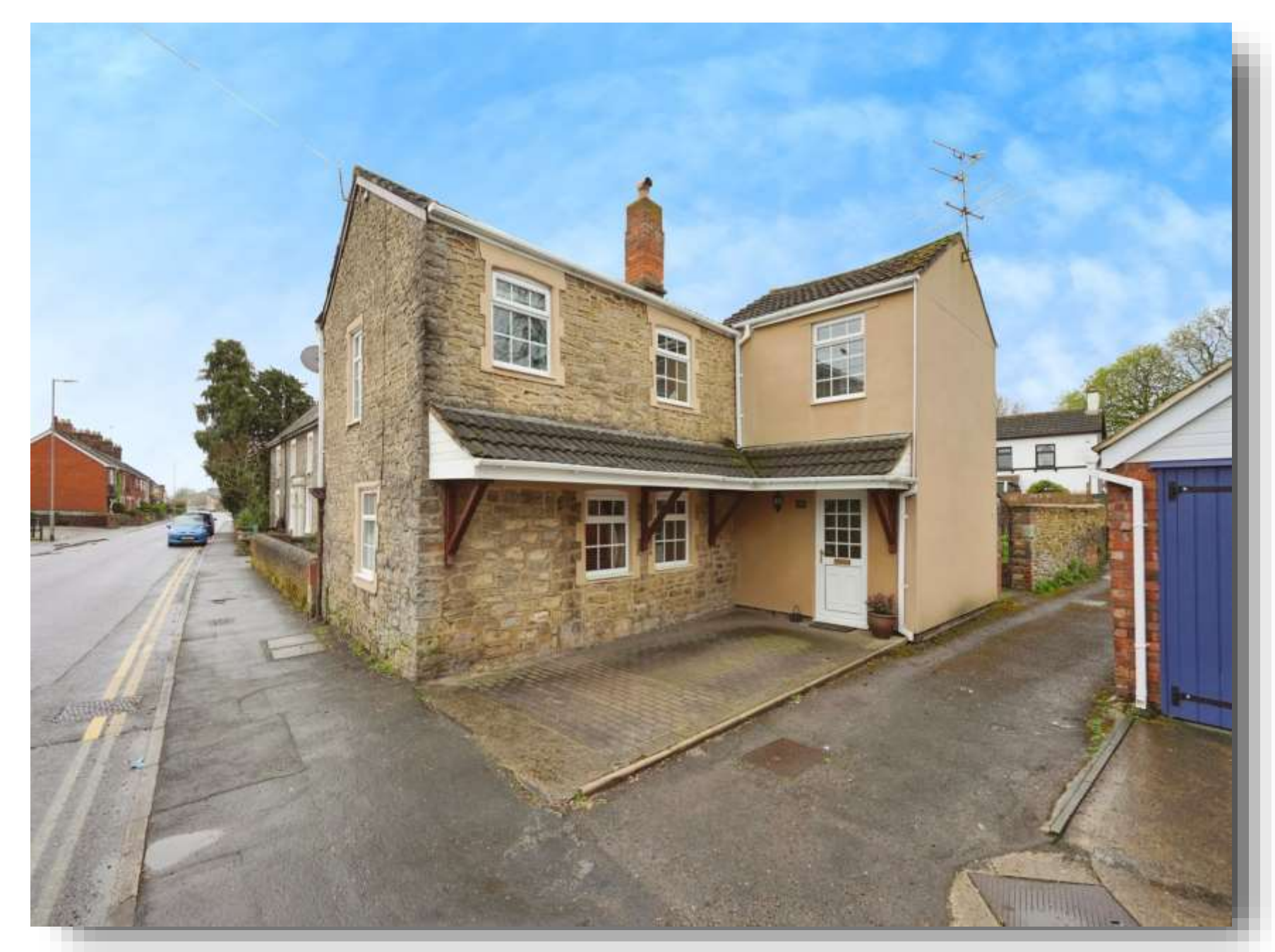
Ermin Street, Swindon SN3 4NE