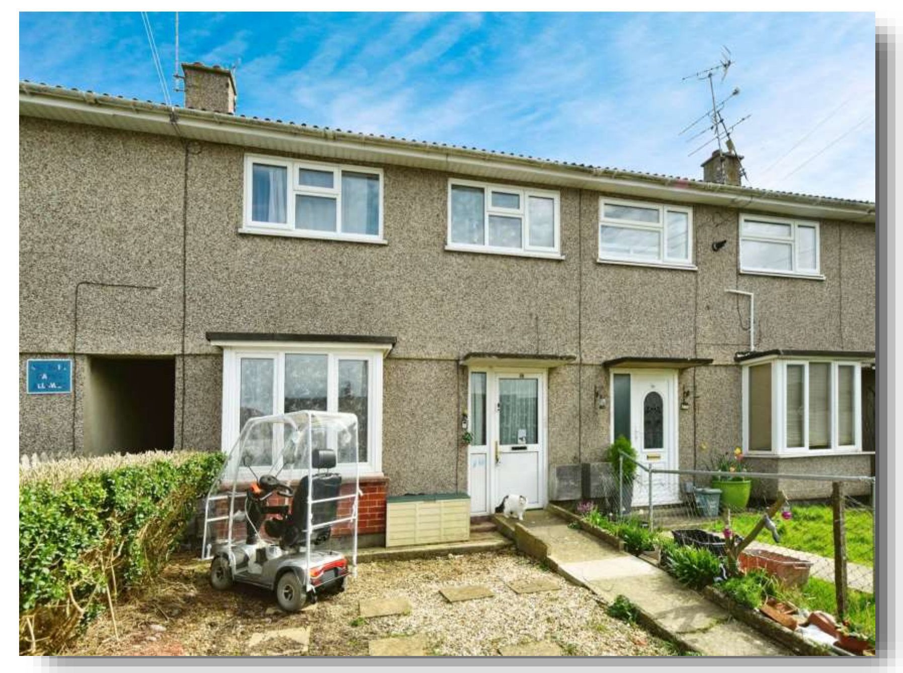
Carstairs Avenue, Swindon SN3 2DF