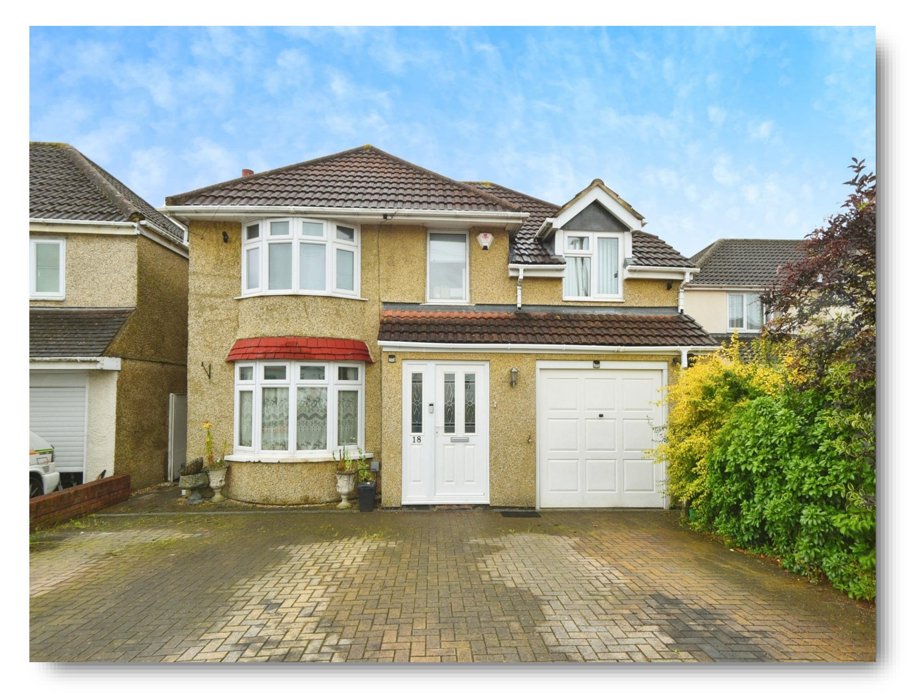
Orchard Grove, SWINDON SN2 7QR