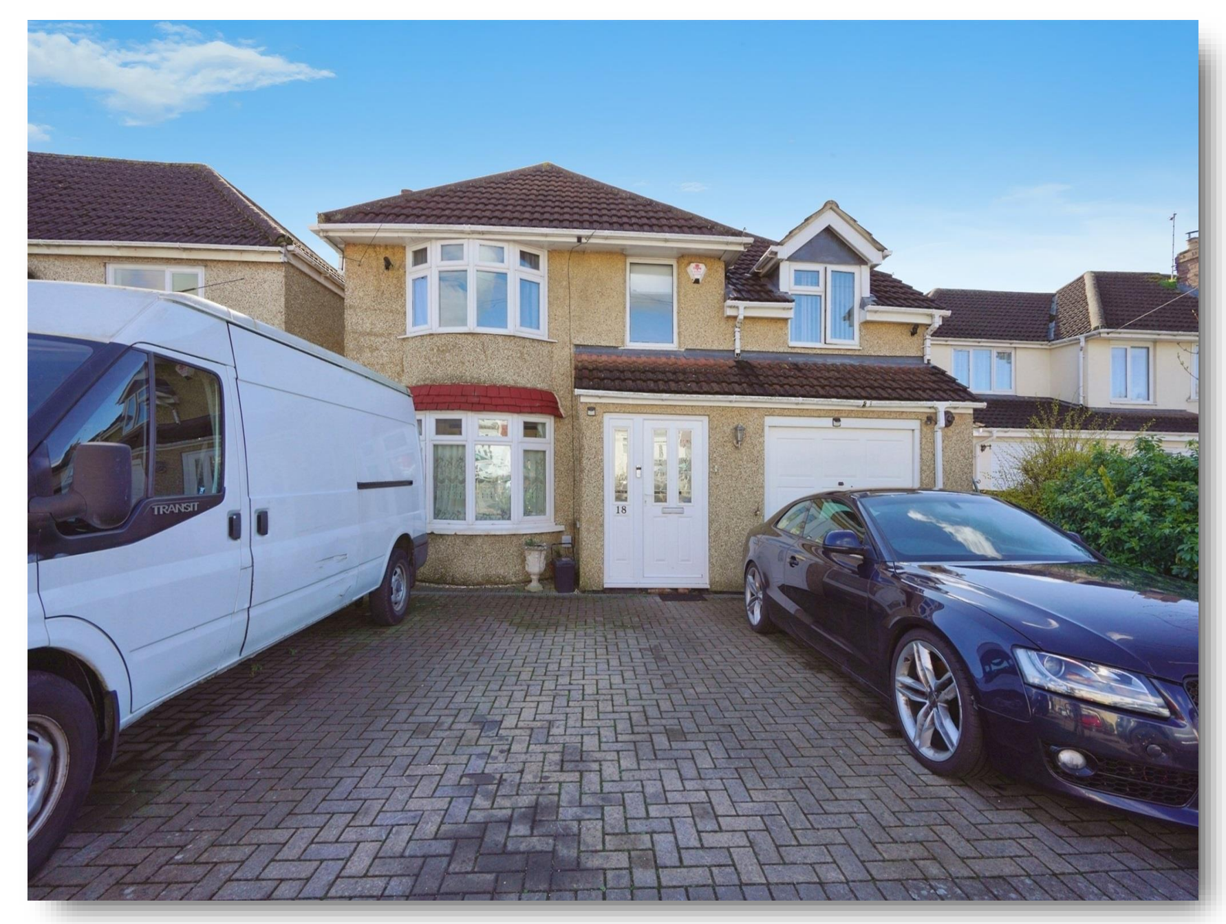
Orchard Grove, Swindon SN2 7QR