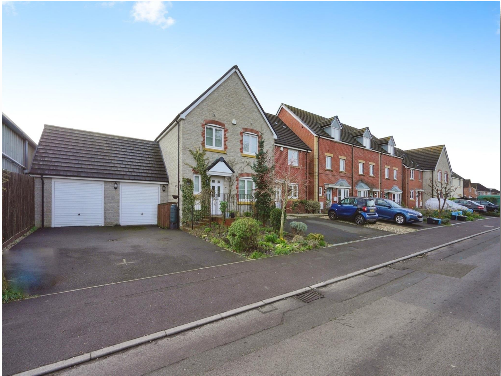
Station Halt, Swindon SN3 4GL