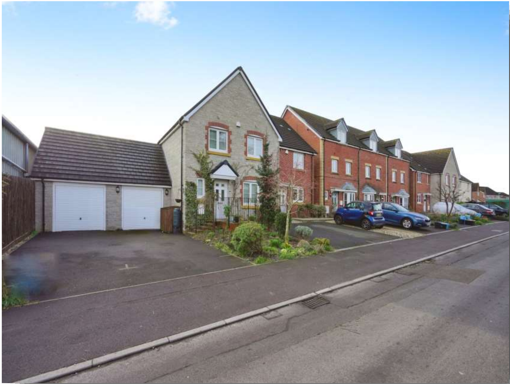
Station Halt, Swindon SN3 4GL