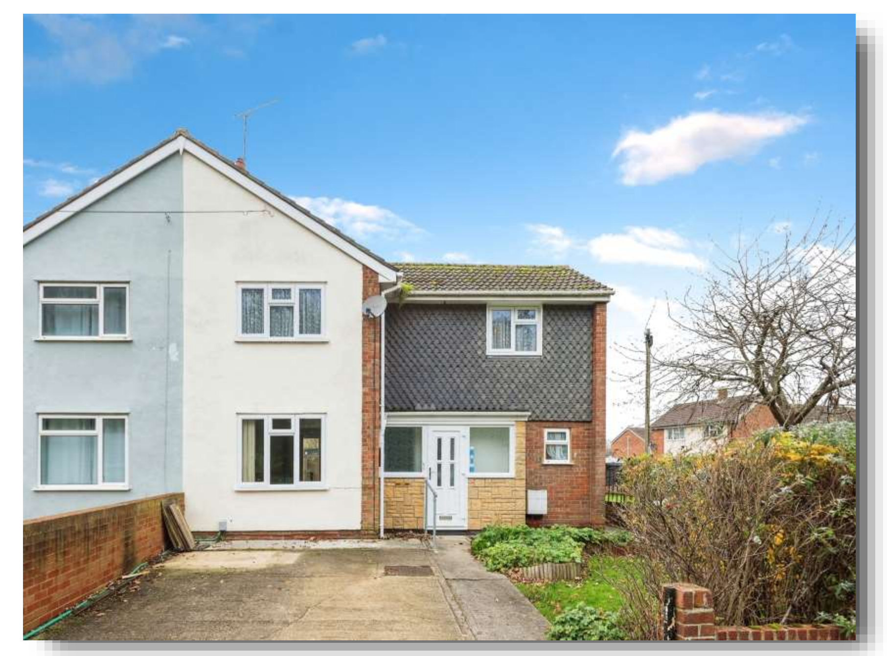
Shaftesbury Avenue, Swindon SN3 2BD