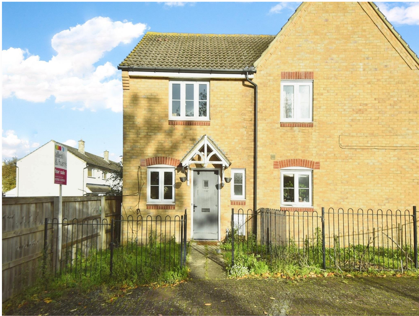
Horsham Road, Swindon SN3 2BN