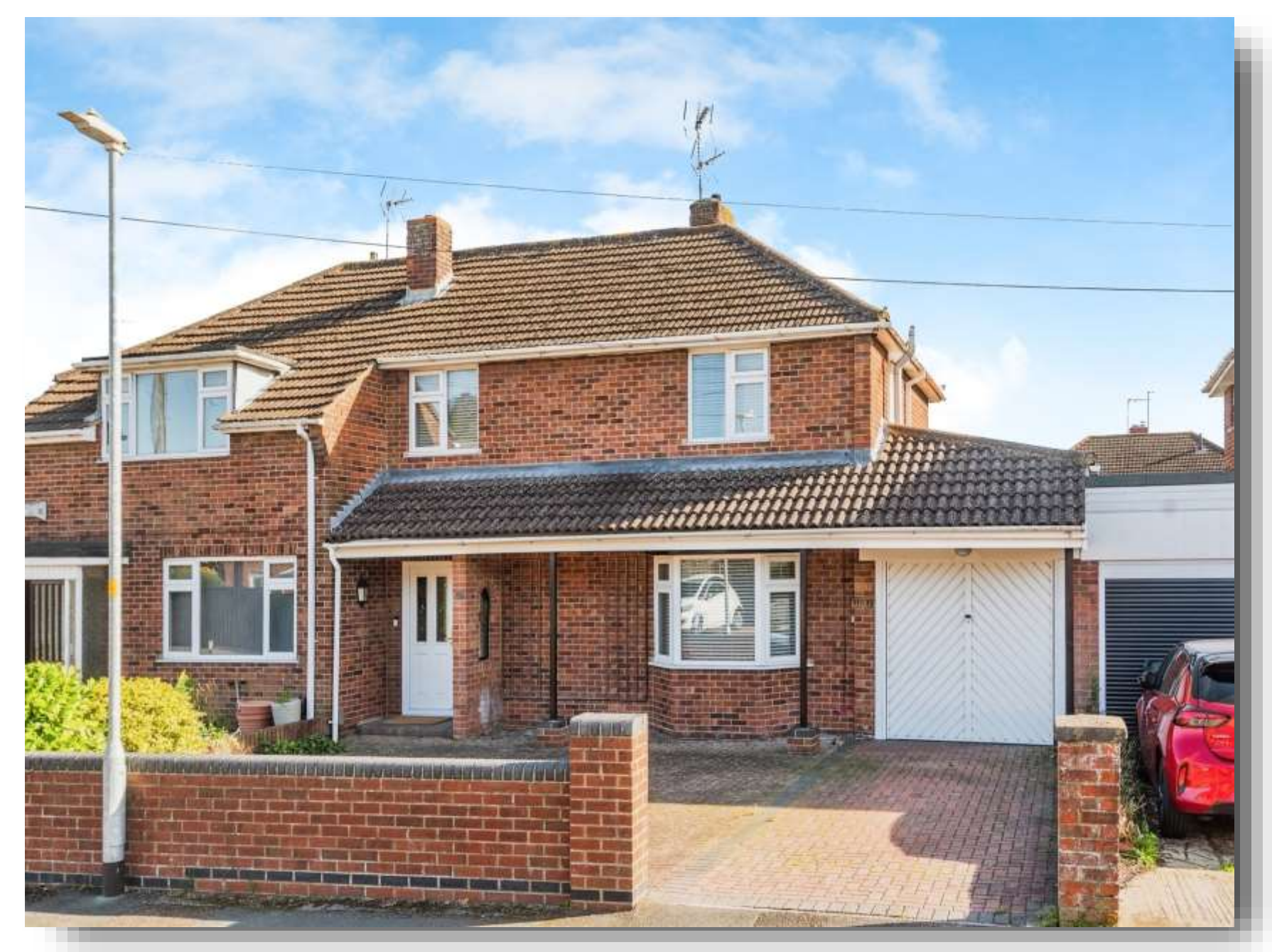
Burns Way, Swindon SN2 7LP