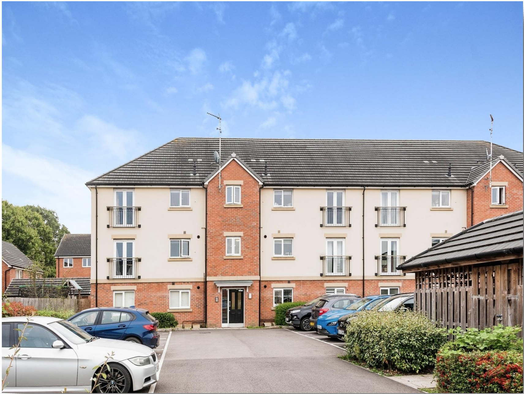
Collingwood Crescent, Swindon SN2 7AN