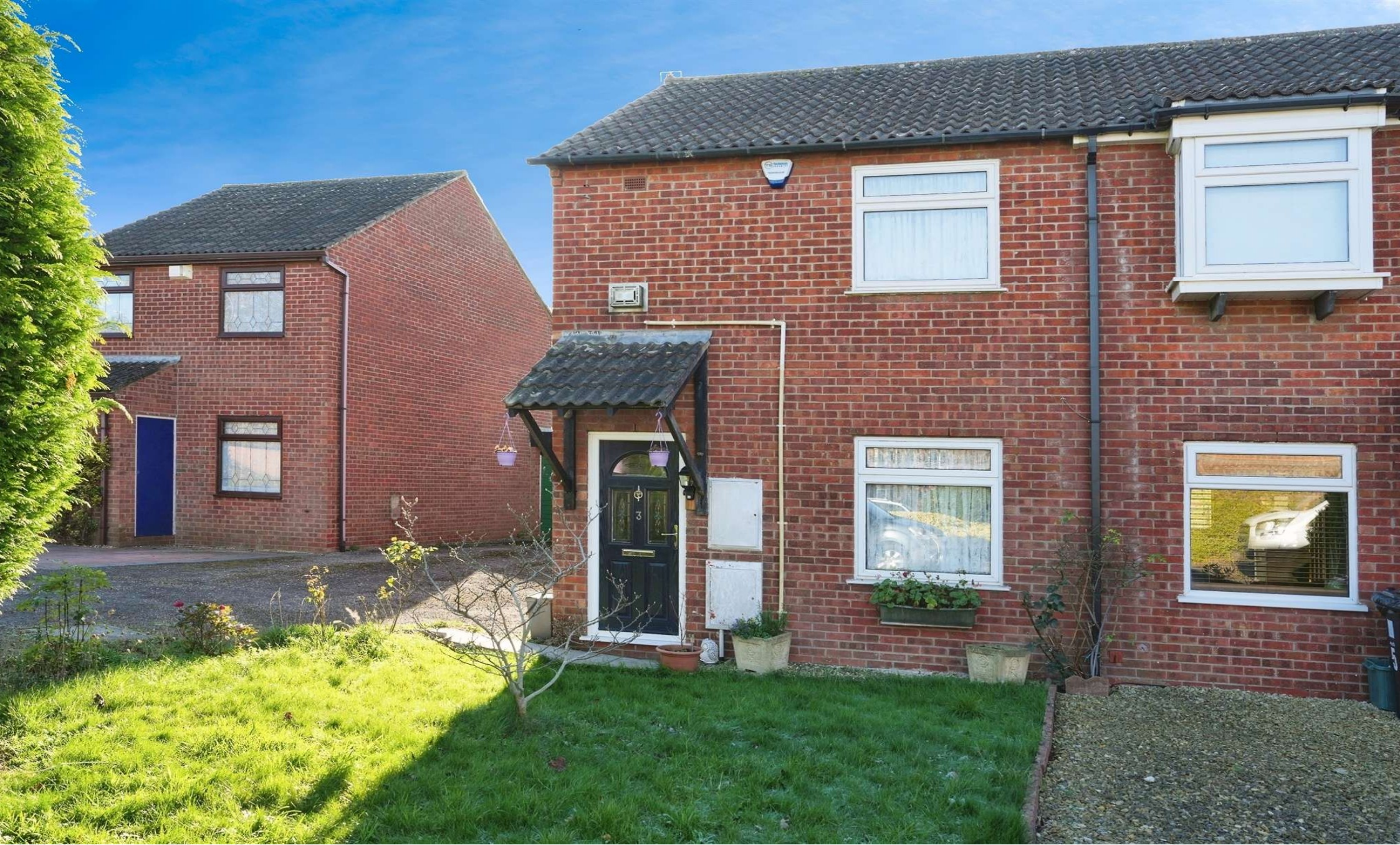
Buckingham Drive, Stoke Gifford Bristol BS34 8NS