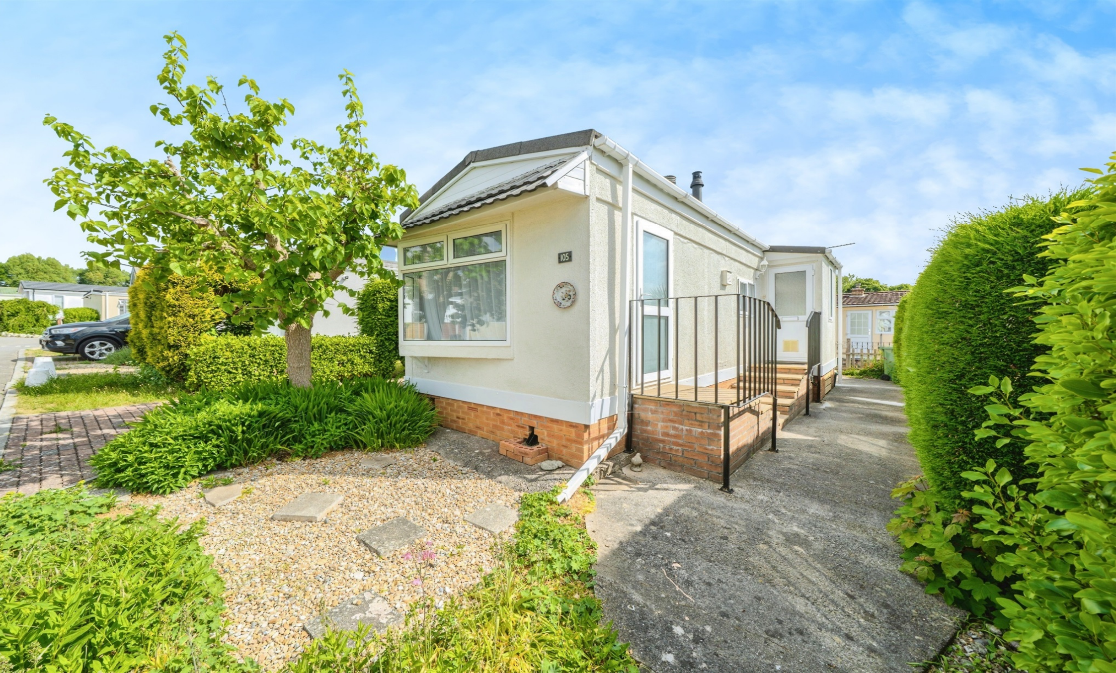
Woodlands Park, Almondsbury Bristol BS32 4AY