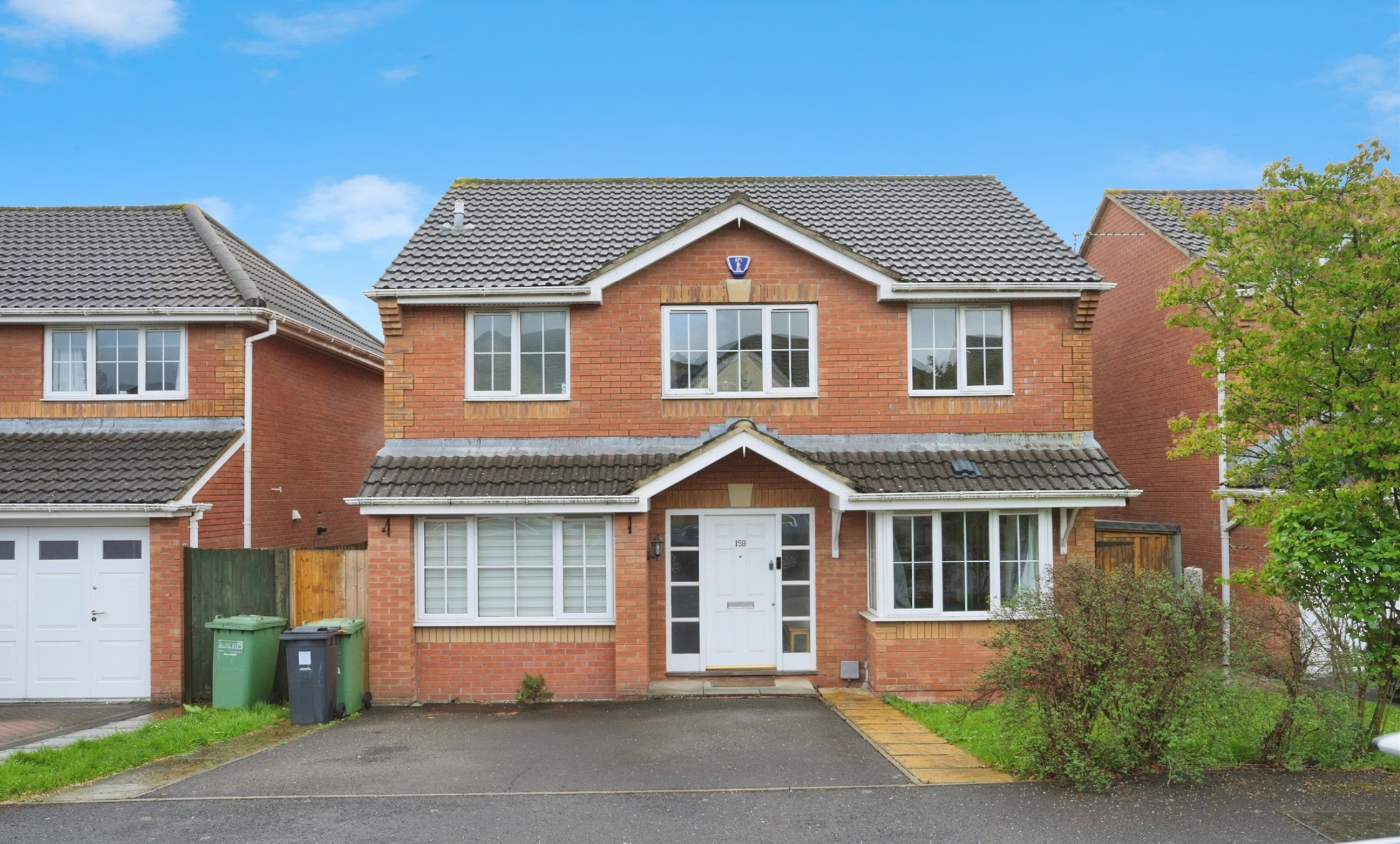
Bakers Ground, Stoke Gifford Bristol BS34 8GE