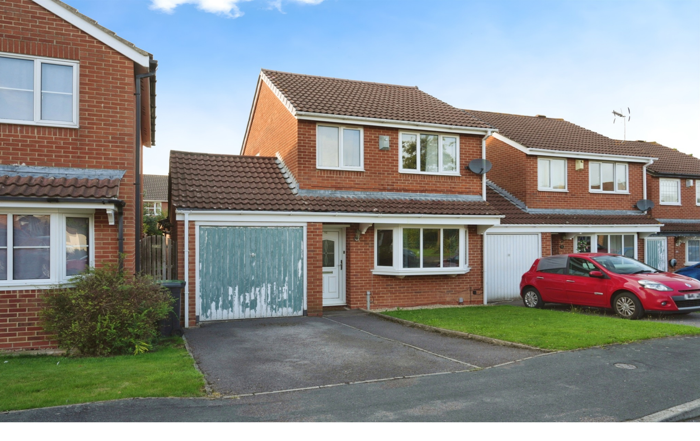
Oak Close, Little Stoke Bristol BS34 6RD