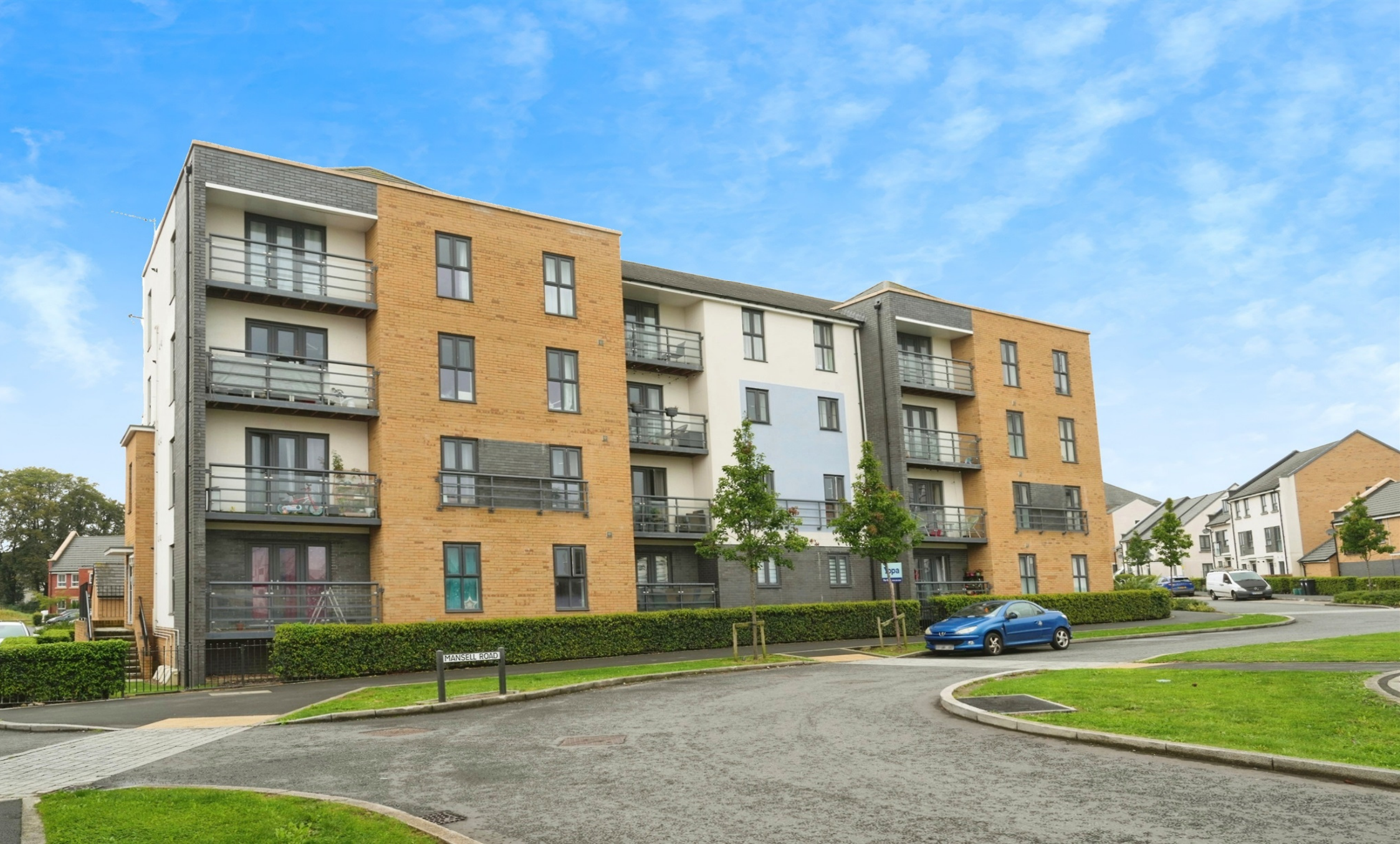
Mansell Road, Patchway Bristol BS34 5QX