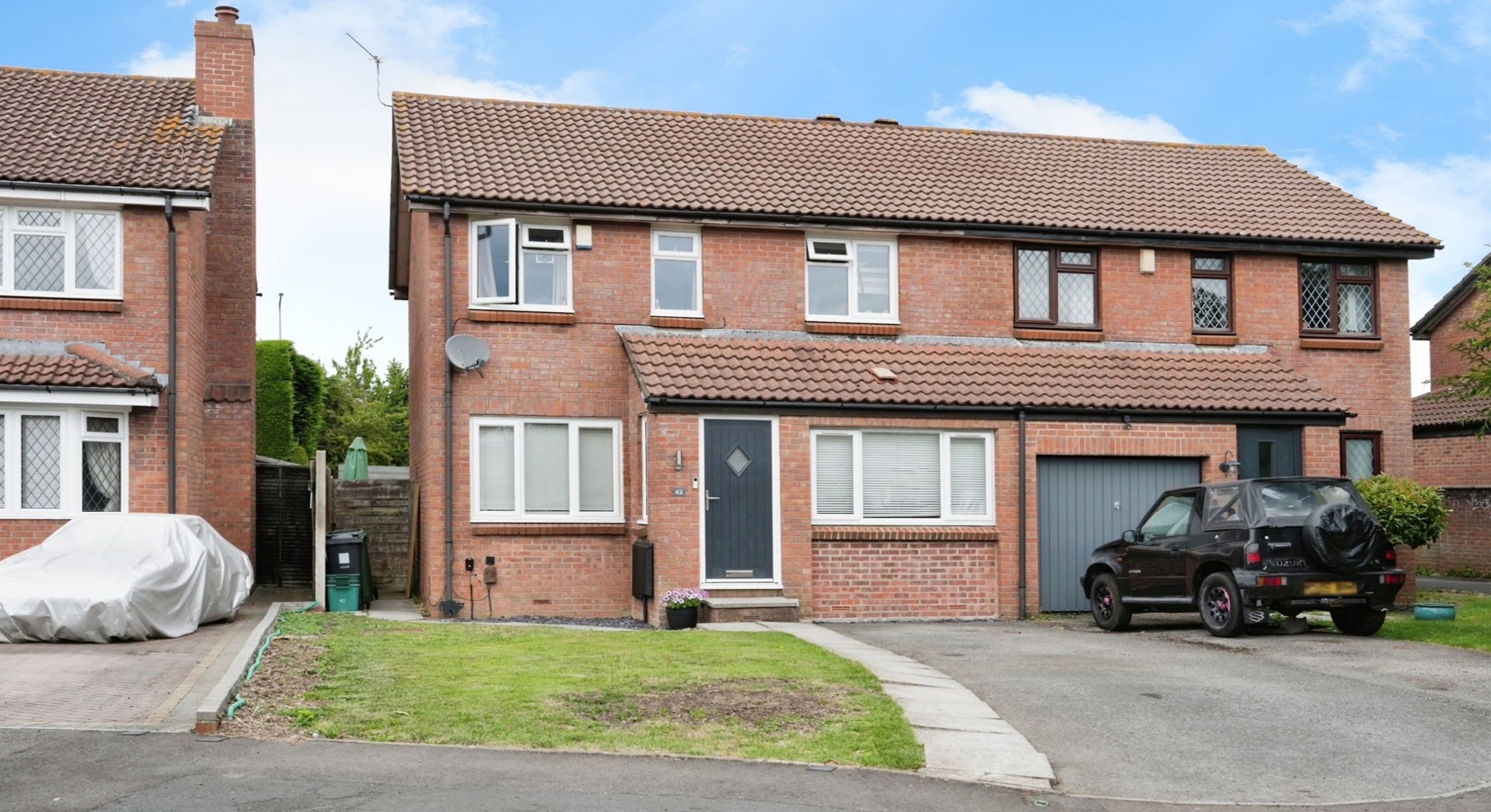
Gadshill Drive, Stoke Gifford Bristol BS34 8UX