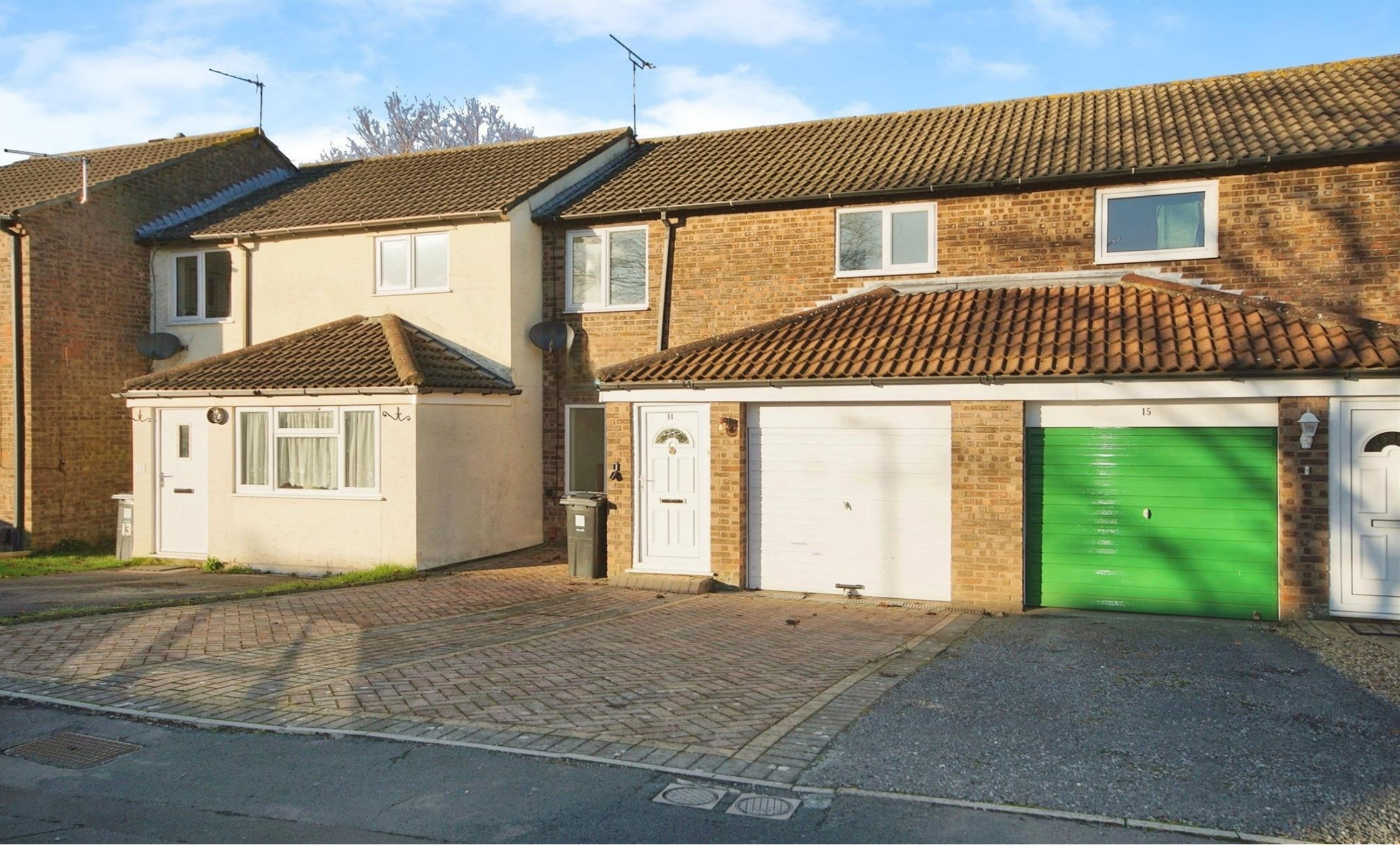
Charles Avenue, Stoke Gifford Bristol BS34 8LW