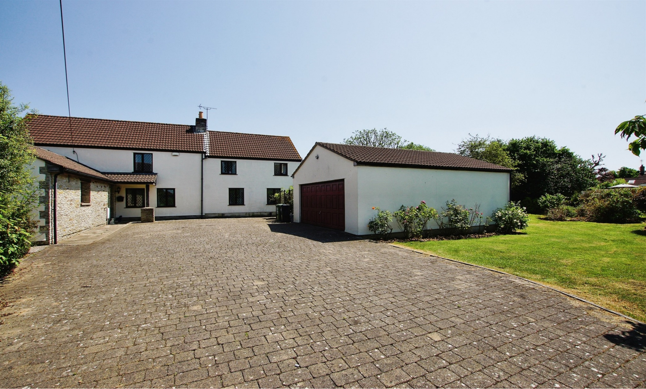
Hill House North Road, Stoke Gifford Bristol BS34 8PW