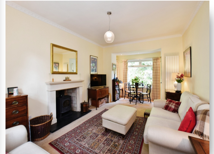
The Braes, Castle Road, Doune, FK16 6EA