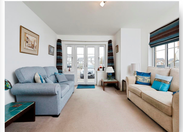
Rollock Street, Stirling, FK8 2PP