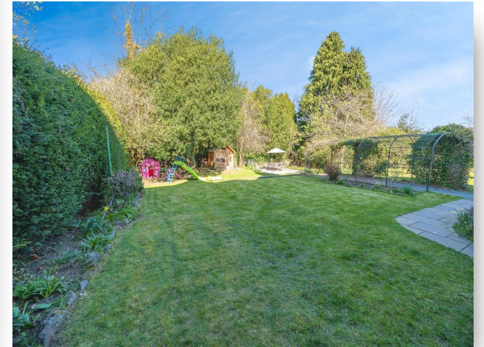
Lower Kingsmuir Hall, Bonnington Road, Peebles, EH45 9HE