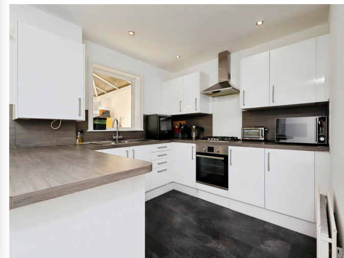
Alexander Mcleod Place, Fallin, FK7 7HP