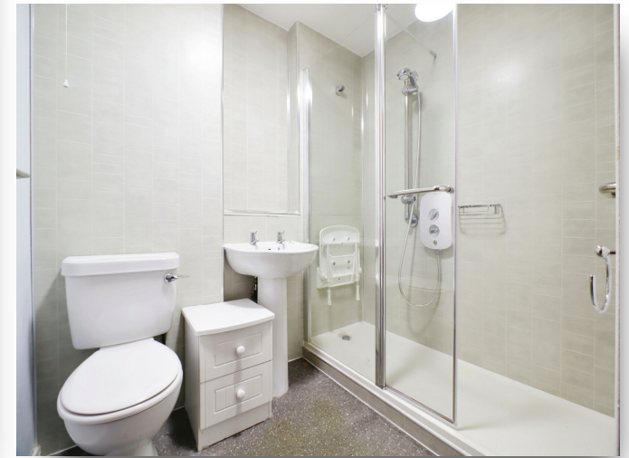
Forth Court, Stirling, FK8 1XW