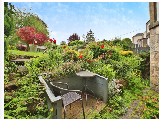
Park Terrace, Stirling, FK8 2JT