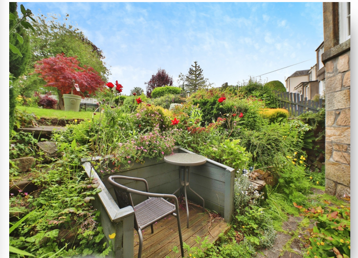
Park Terrace, Stirling, FK8 2JT