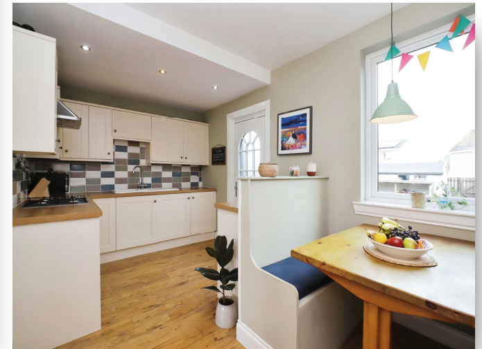
Underwood Cottages, Cambusbarron, Stirling, FK7 9NZ