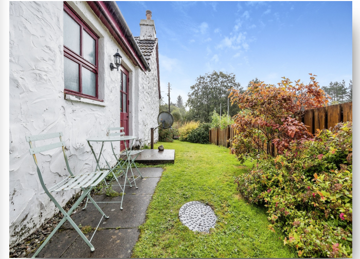
Crombie Cottage, Clifton Road, Tyndrum, Crianlarich, FK20 8SA