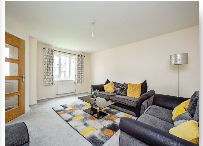
McLean Crescent, Whitburn, Bathgate, EH47 0ST