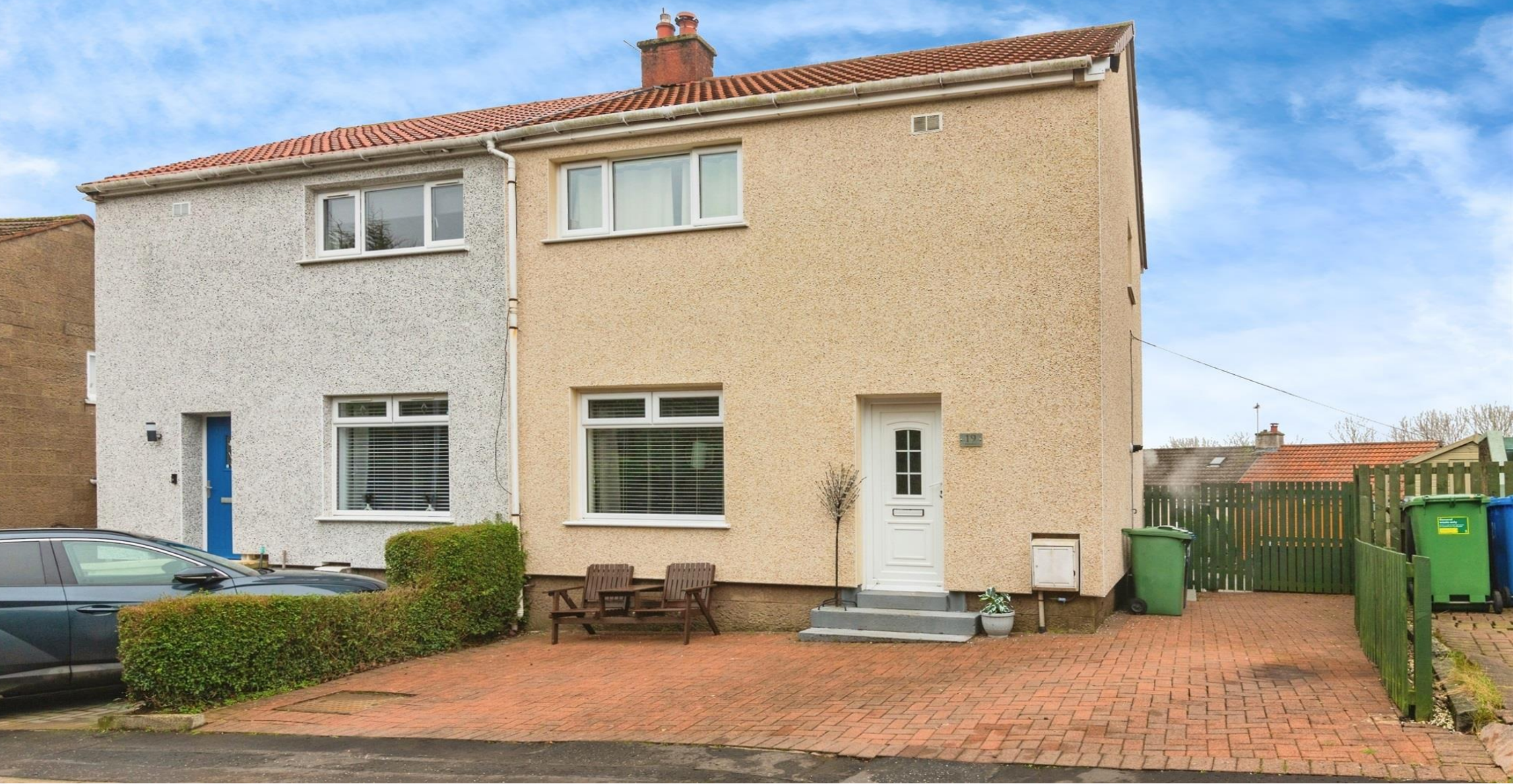
Kinarvie Crescent, Glasgow G53 7HA