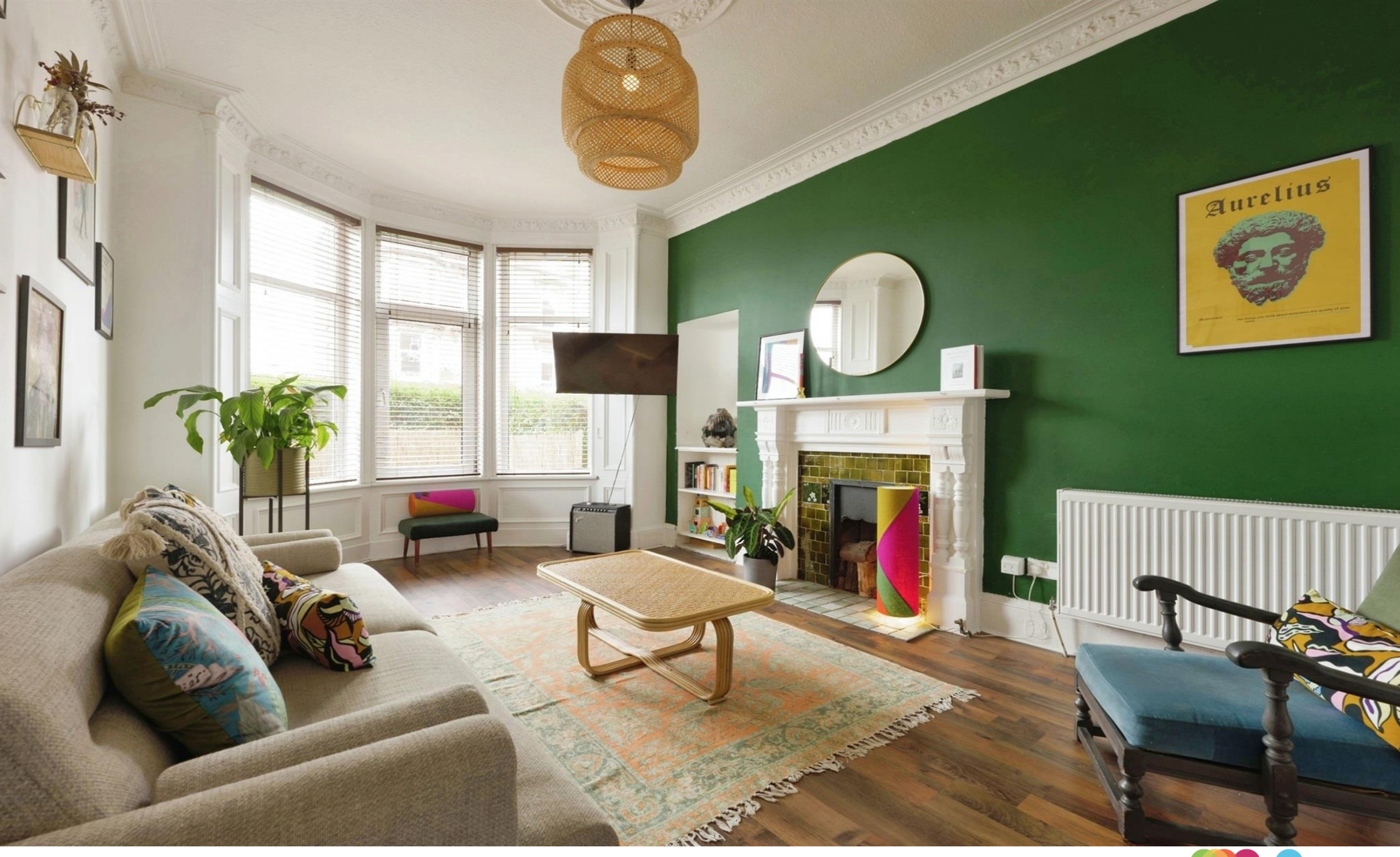
Minard Road, Glasgow G41 2EN