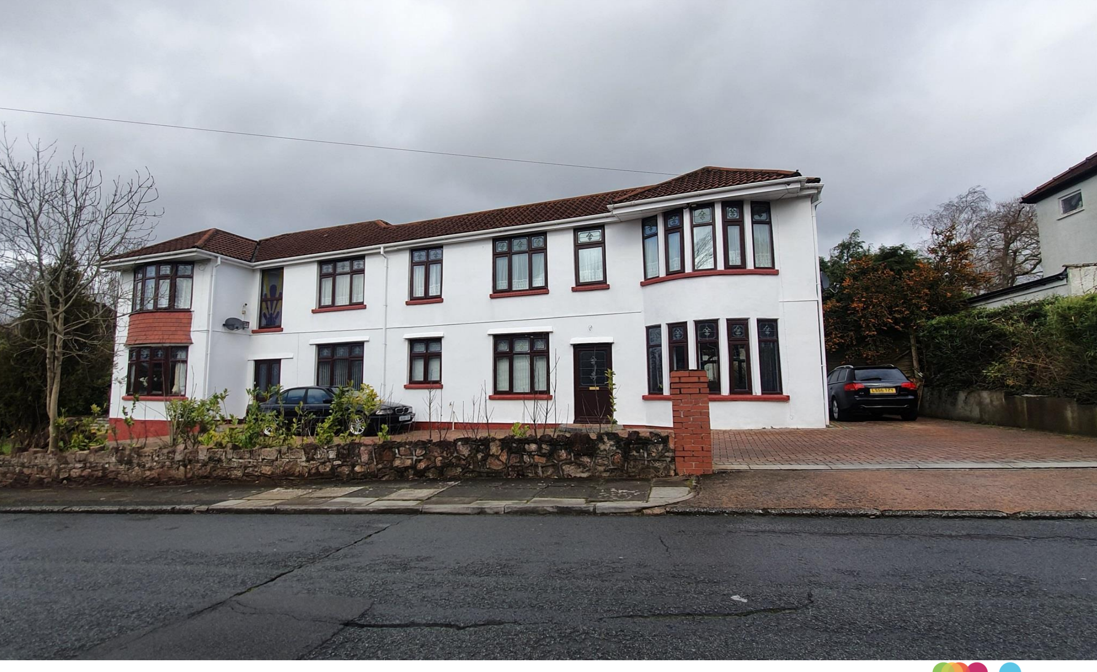
Dan Y Coed Road, Cyncoed Cardiff CF23 6NE