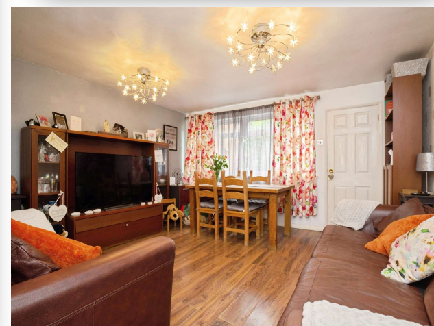
The Hawthorns, Pentwyn Cardiff CF23 7AP