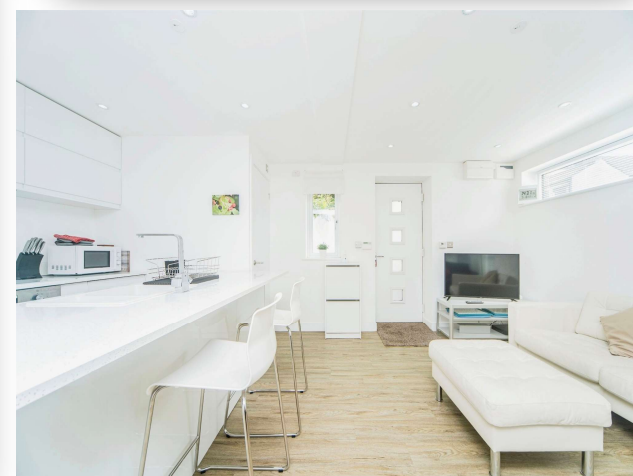
Stone House Tyler Street, Roath Cardiff CF24 1QP