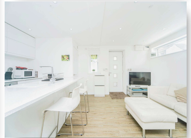
Stone House Tyler Street, Roath Cardiff CF24 1QP