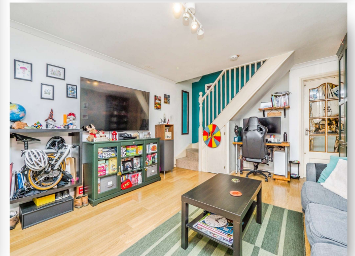
Beckgrove Close, Pengam Green Cardiff CF24 2SE