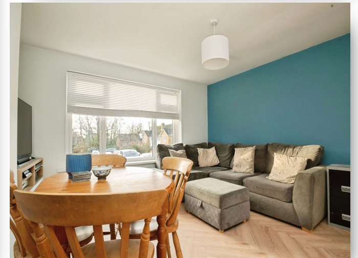
Manitoba Close,Lakeside Cardiff CF23 6HD