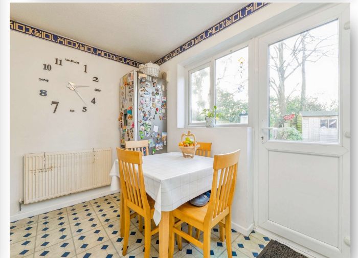
Beckgrove Close, Pengam Green Cardiff CF24 2SE