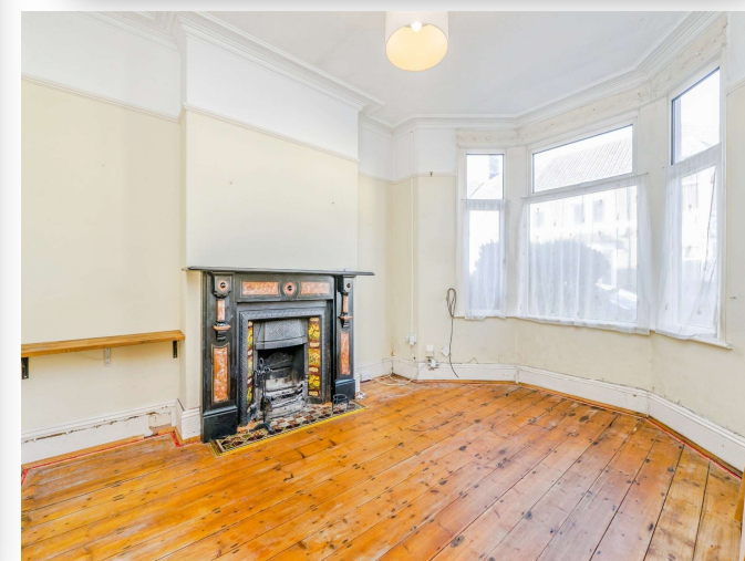
Carlisle Street, Splott Cardiff CF24 2PH