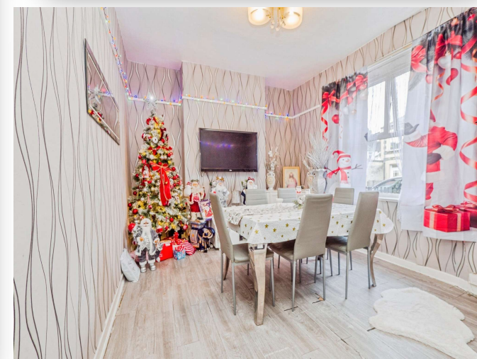
Lead Street, Adamsdown Cardiff CF24 0LJ