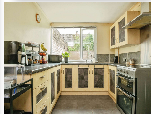
Awel Mor, Llanedeyrn Cardiff CF23 9QA